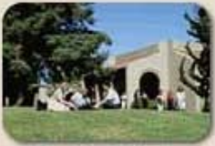
De Anza College