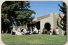
De Anza College